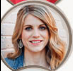
CRYSTAL PAINE author, blogger MoneySavingMom.com