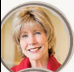
JONI EARECKSON TADA author, founder Joni & Friends